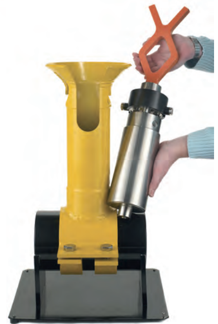
Subsea version of the ClampOn DSP Leak Monitor.

The basic theory is that a leak creates a very high-frequency noise that can be monitored by an ultrasonic sensor. In a «non-leak» situation the ultrasonic pattern will be stable, but when a leak occurs the signature will change drastically. The ClampOn DSP Leak Monitor is based on the ClampOn Ultrasonic Intelligent Sensor technology platform. The instrument's ability to monitor signal at multiple frequency, combined with extreme sensitivity enables it to distin-